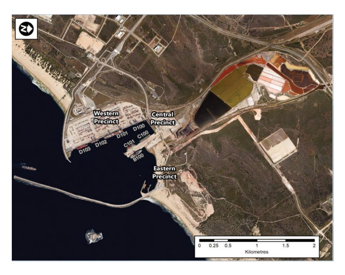
Figure 2: Port of Ngqura Precincts